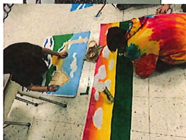
Left: 8th graders work on their part of collaborative murals.